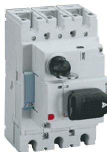
4 210 00